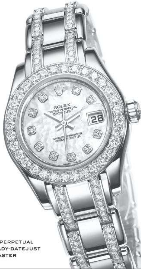
OYSTER PERPETUAL 29MM LADY-DATEJUST PEARLMASTER