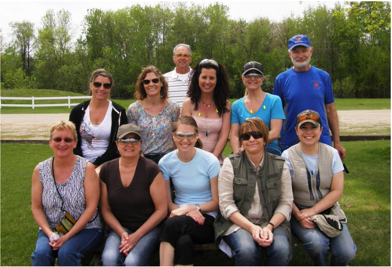
Ladies Day 2014

We held this event for the first time a few years back, had a great turnout, and all the "new" shotgun enthusiasts went home with big smiles after breaking some clays. On May 30<sup>th</sup>, MGC will again be hosting Ladies Day, where we will offer wives, girlfriends,